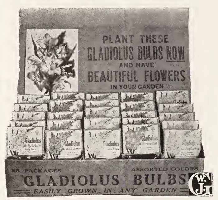
Display Carton Containing 25 Packages Assorted Gladiolus

The advantages of handling packaged bulbs and roots are obvious. The moisture-proof covering prevents evaporation and maintains these subjects in a live condition much longer than when they are exposed to dry store atmospheric conditions. Packaged items permit of a clean, orderly and attractive display and entirely eliminate the waste and culls prevalent with the handling of bulk merchandise. In addition, the wrappers provide an opportunity of giving descriptions and growing instructions which are so vital to the maintenance of satisfied customers.